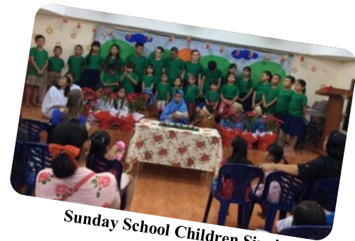
Sunday School Children Singing