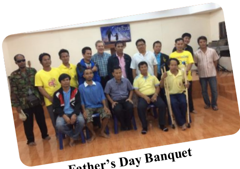
Father's Day Banquet