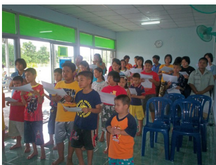
Singing after English