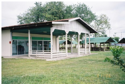
Send the Light Baptist Church